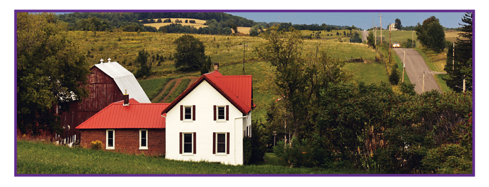
Public Health agency of Canada. (2004),"How prevalent is women abuse in rural areas?" Canadian Health Network quoted in Rural Public Health Report (2007). Haldimand-Norfolk Health Unit.

Attitudes – slow to admit that domestic violence is a serious problem; stigma attached if women use mental health services; hard to admit to abuse because women feel it is their fault; leaving means leaving a way of life, one's home and one's community; and disruption of leaving is even greater for farm women because there is no separation between home and work.