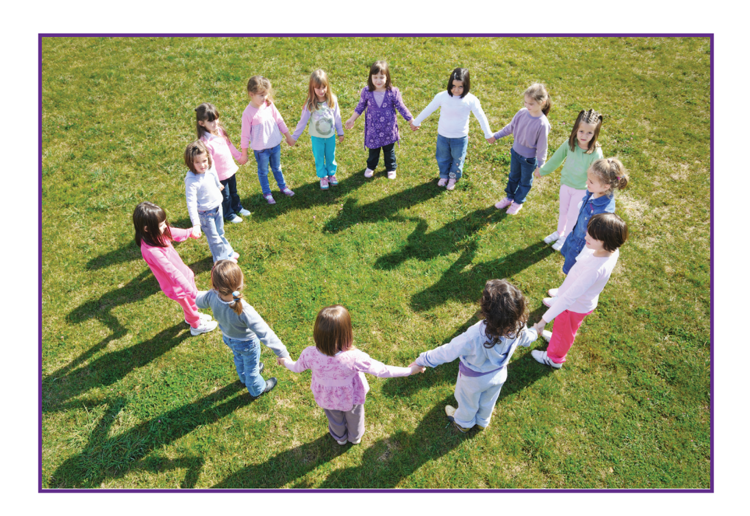
Canadian Women's Foundation, "FACT SHEET- Moving women out of violence"

Violence against women impacts children. Specifically, it has influence over their behaviour, attitudes, mental health, and emotional stability. It has been estimated that children see or hear 40% to 80% of domestic assaults, and each year, approximately 360,000 Canadian children witness or experience family violence. Long-term exposure to family violence can negatively affect children's brain development and their abilities to learn. This exposure can lead to a range of behavioural and emotional issues such as increased anxiety, aggression, bullying, phobias, and insomnia. In addition, children who witness violence have an increased risk of developing psychiatric disorders compared with children from non-violent homes. The cycle of violence continues because these children are more likely to become victims or abusers as adults compared with other children who did not witness violence regularly.<sup>14</sup>